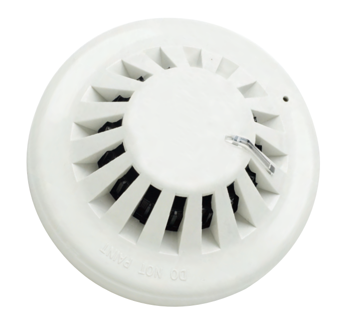
FXN922 multi-mode detector