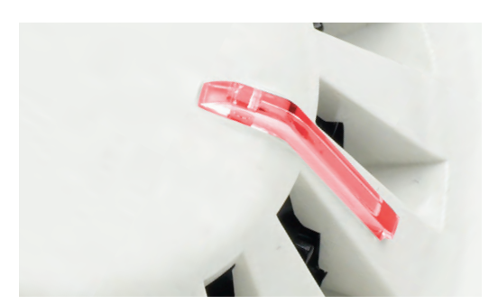
Red LED, fire condition