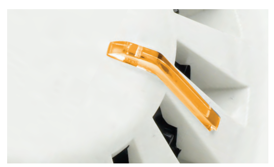
Amber LED, drift compensation limit reached