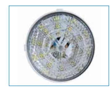
LED technology of 2000 lumens light output