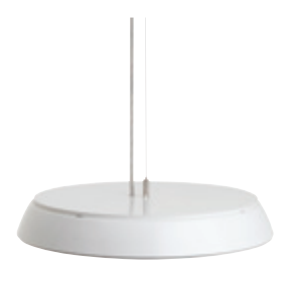
Top view with cover plate (PELBP)