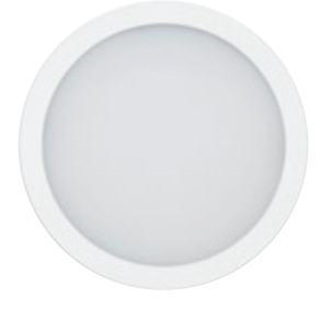
View from below