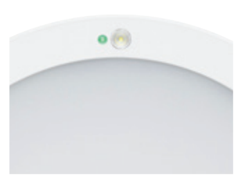
With integrated emergency module